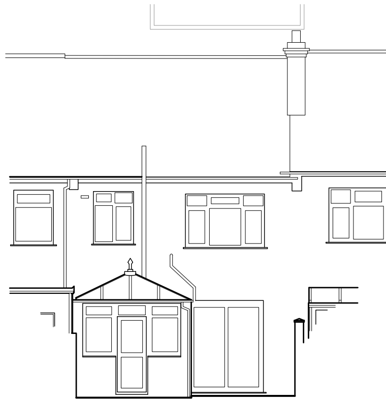
existing rear elevation