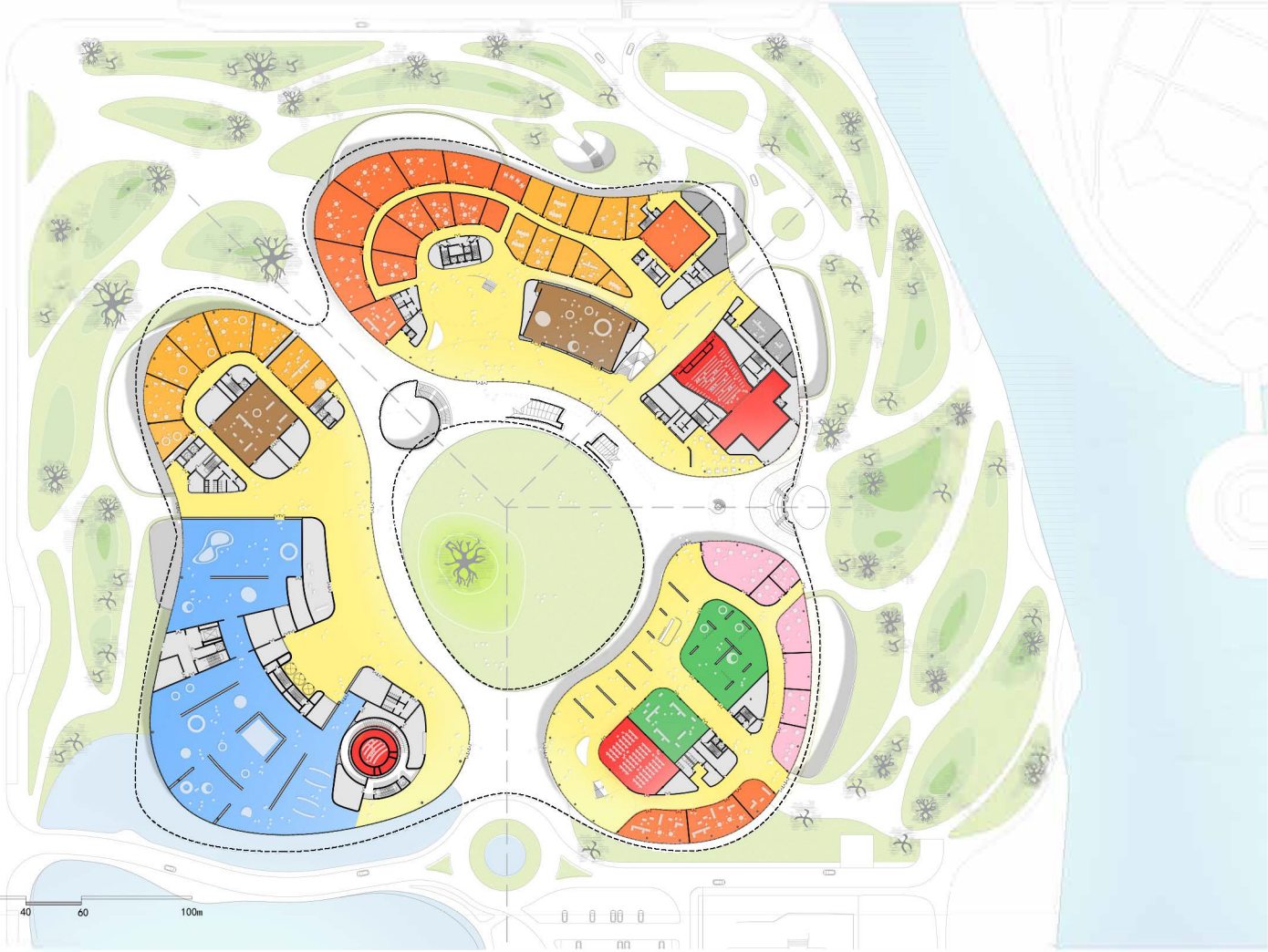
0 20 40 60 100m 首层平面 Ground Floor Plan