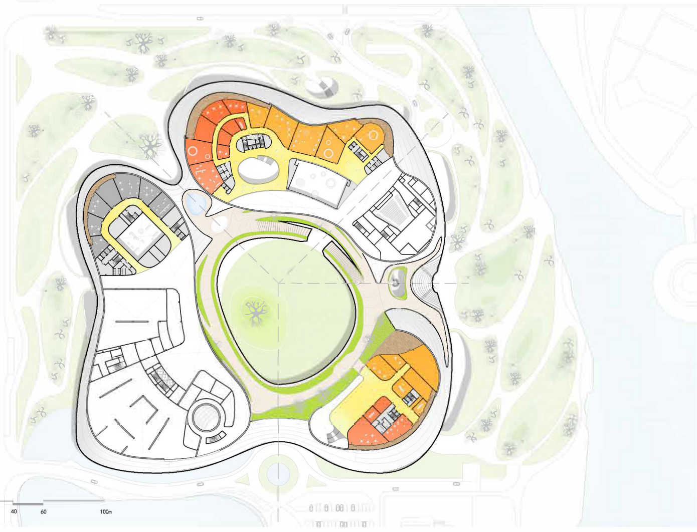
0 20 40 60 100m 二层平面 Second Floor Plan