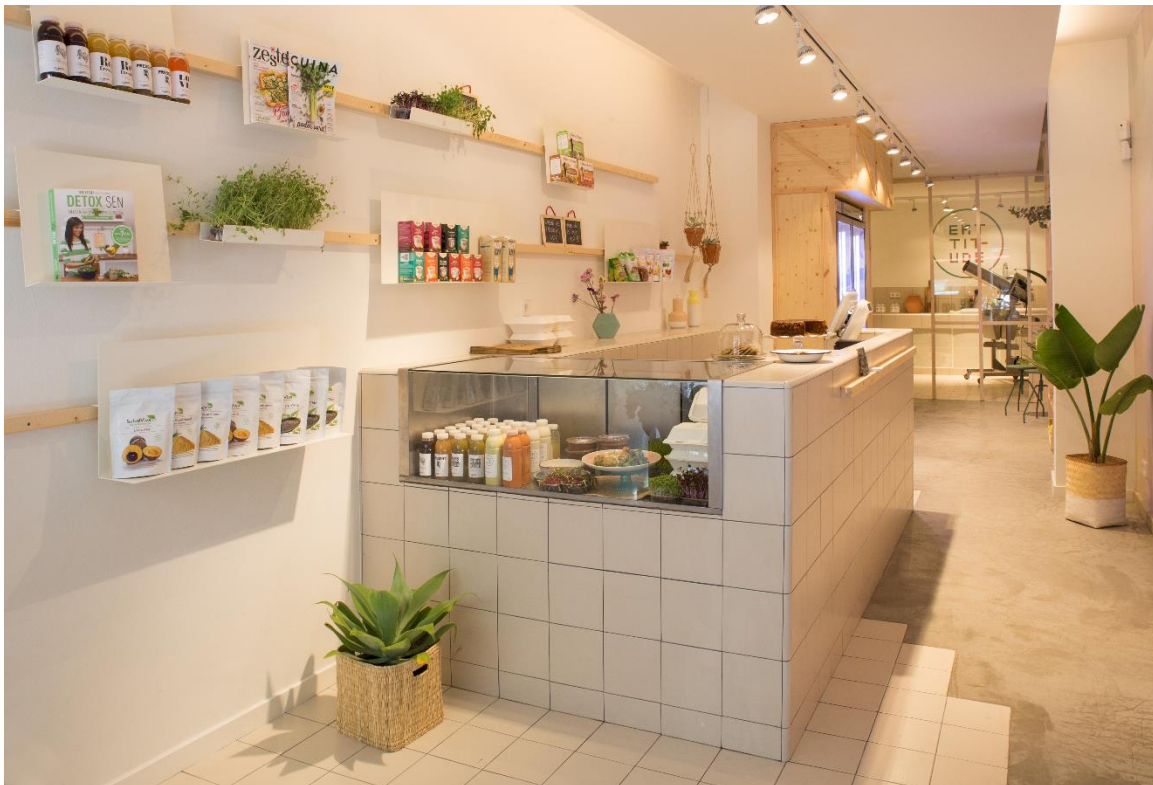
Space EATTITUDE Barcelona

Born in Barcelona EATTITUDE , is an innovative space with the intention to change the widespread negative connotations attached to the idea of "diet". This new space aims to provide a differential value to the take-away food concept, offering a different option in the world of healthy and vegan food. A nutritional expert and a specialized health food chef are the architects of a balanced, energetic and above all tasty menus EATTITUDE proposes weekly.