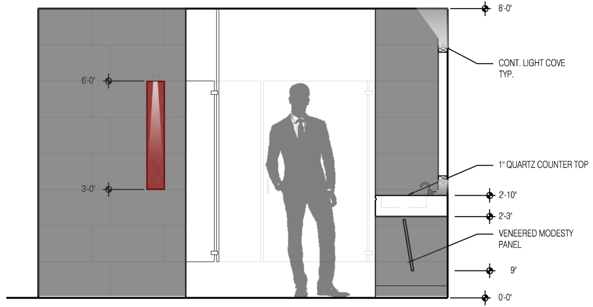
E.1:CFI-9.4 RESTROOM ENTRY 3/8" = 1'-0"