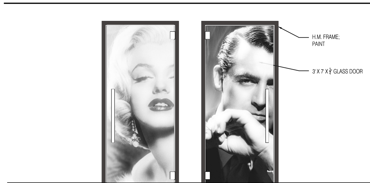
B.3:CFI-9.4 RESTROOM DOOR ELEVATION 3/8" = 1'-0"