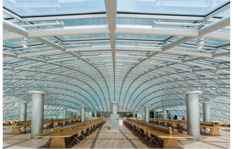
Grand Reading Room facing north

Automated Storage and Retrieval System: The ASRS shelves materials underground by size rather than library classification, in racks extending 50 feet down, with a capacity to hold 3.5 million volume equivalents.