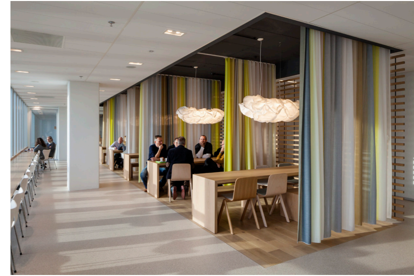
RESTAURANT ON THE 21ST FLOOR