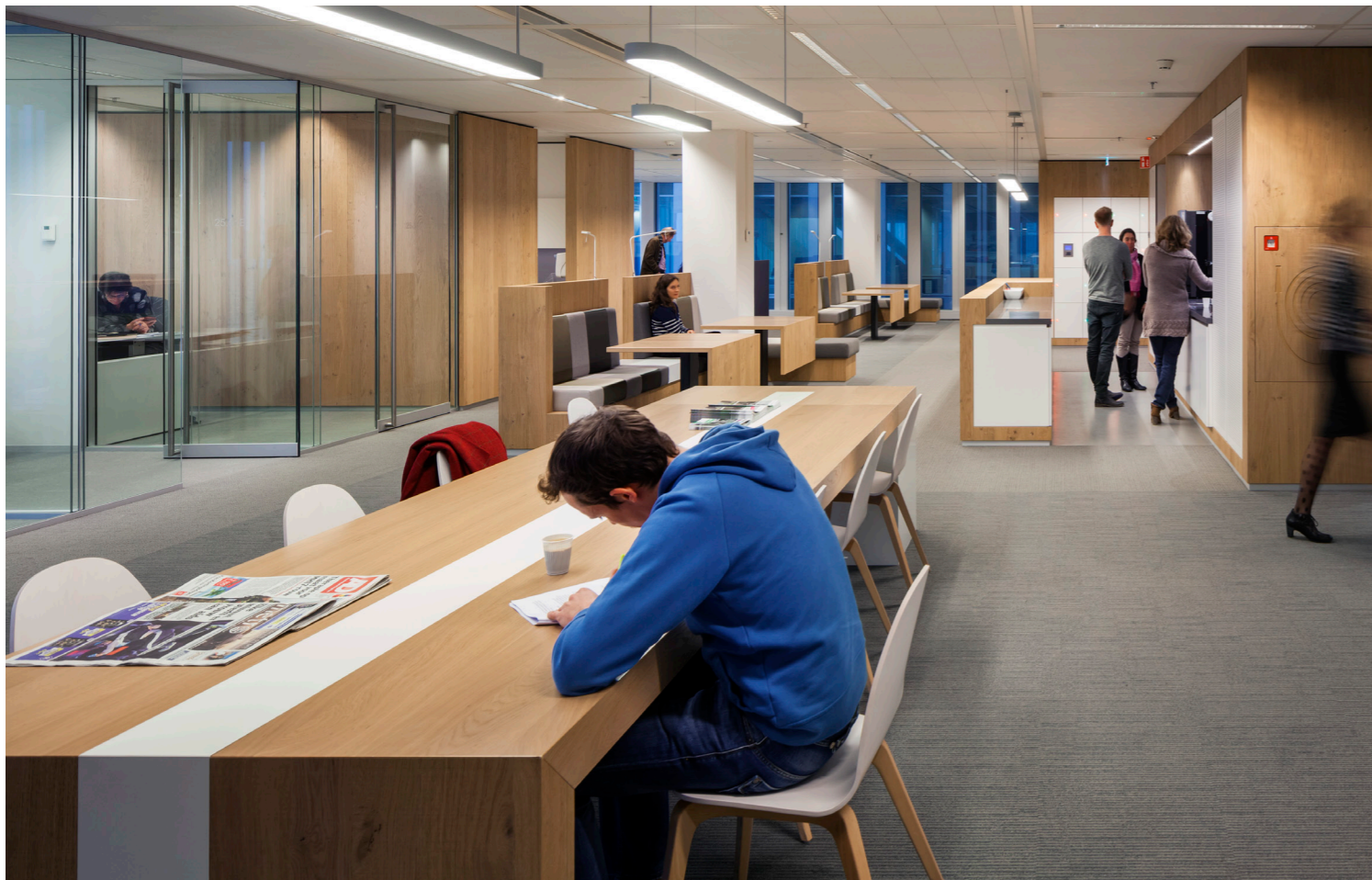
IMPRESSION GENERIC OFFICE FLOORS