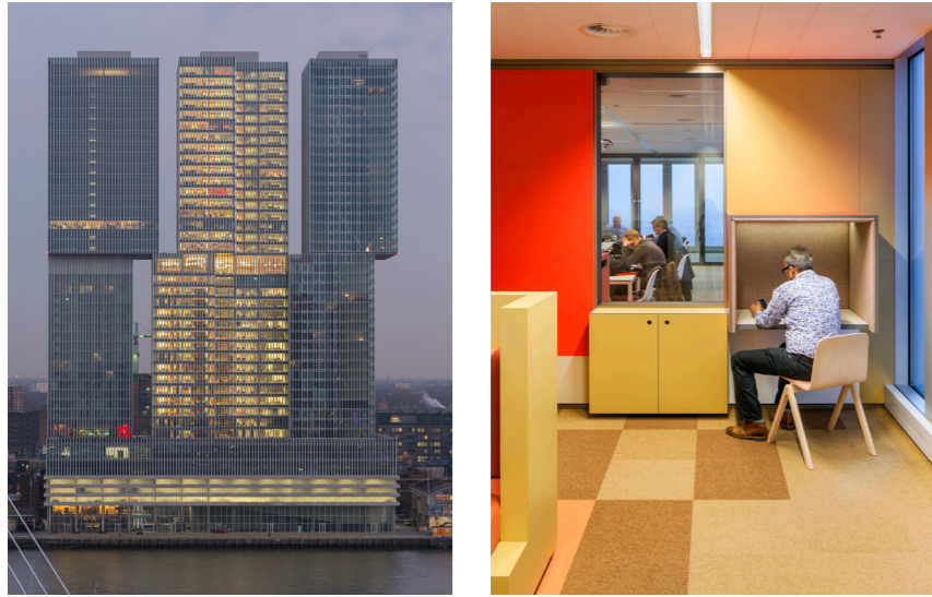
INTERIOR "DE ROTTERDAM", IN THE MIDDLE TOWER