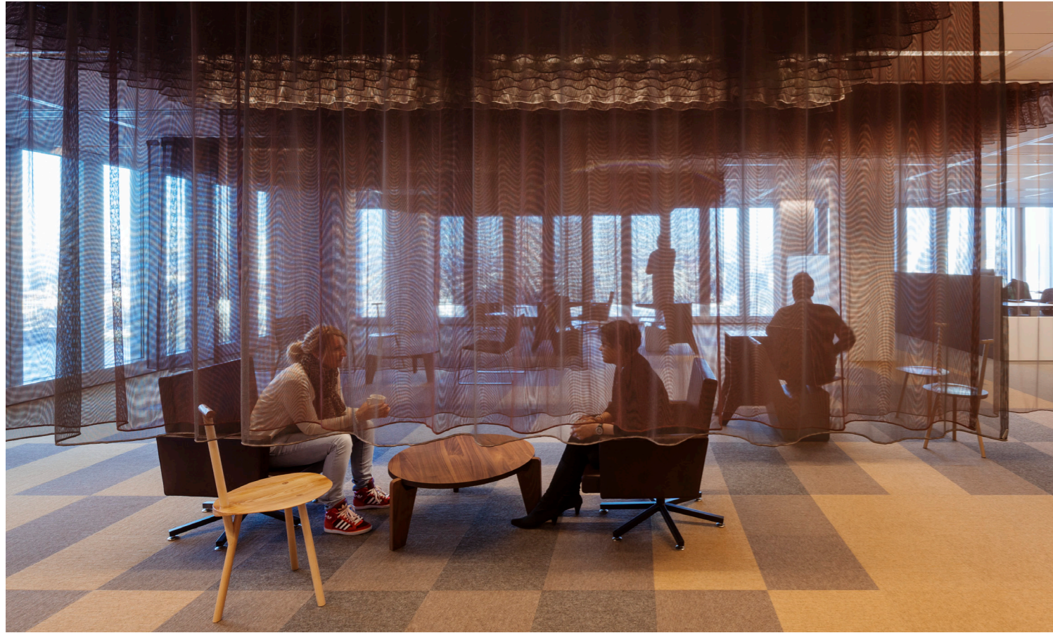
CITY CENTER ON THE 22ND FLOOR