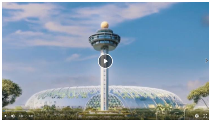
Video 1: The Making of Jewel Changi Airport

A photo-friendly enclave set within the Canopy Park, this walk features creative topiary art in the shape of life-size animals.