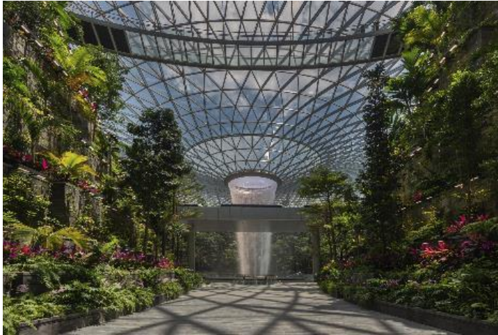
Image 1: View of the Shiseido Forest Valley and the HSBC Rain Vortex from Changi Airport Terminal 1

Upon setting foot into Jewel, visitors are greeted by the majestic 40-metre HSBC Rain Vortex, the world's tallest indoor waterfall.