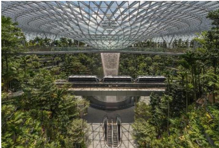
Image 2: View of the Shiseido Forest Valley and the HSBC Rain Vortex from the South Viewing Deck

Upon setting foot into Jewel, visitors are greeted by the majestic 40-metre HSBC Rain Vortex, the world's tallest indoor waterfall.