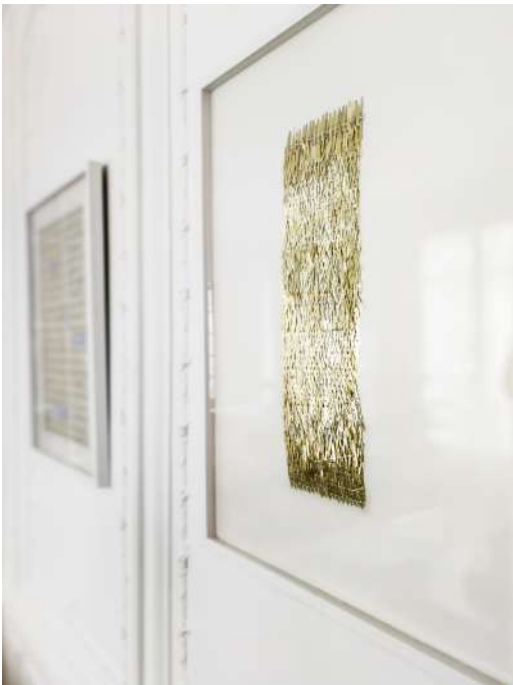
Left - Sourced art in a local gallery