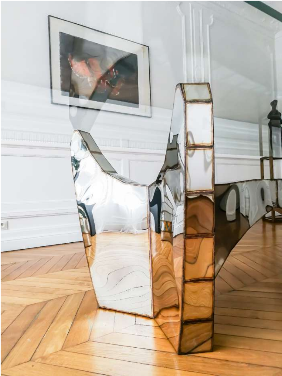
Dining room table detailing. Welded mirror base and glass top.