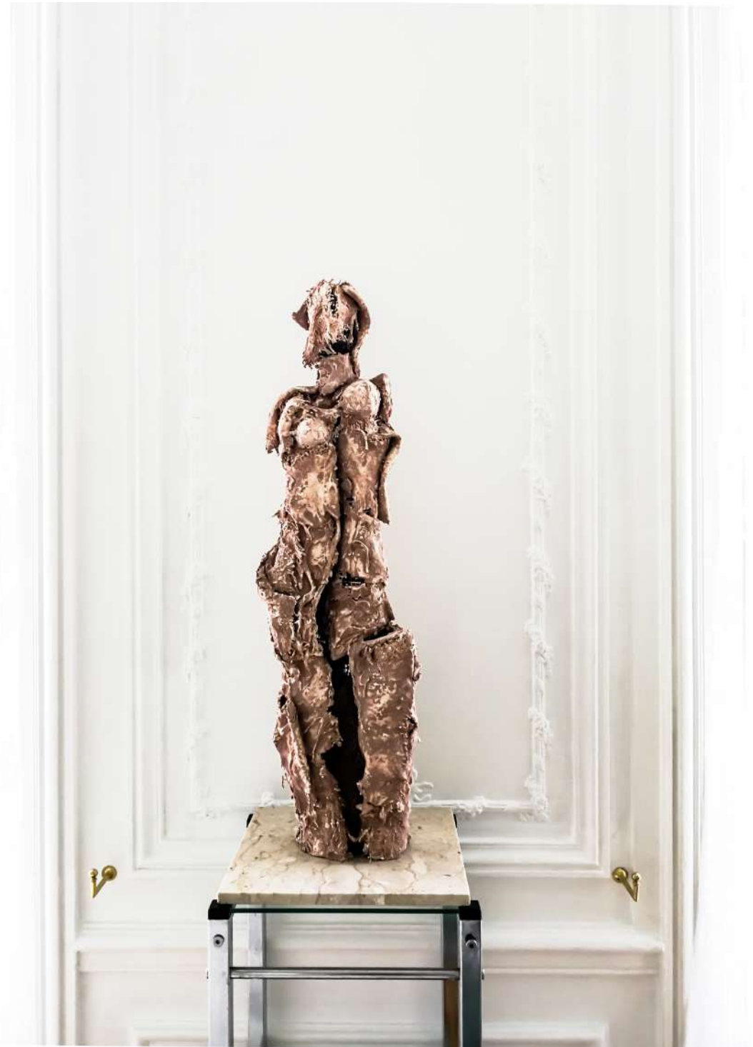
Right - Client's owned sculpture