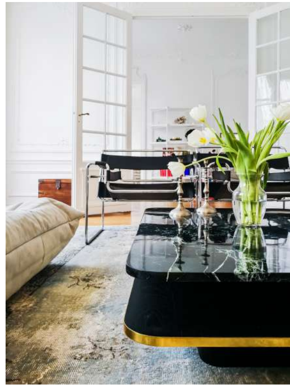
Above - Entry to the office space