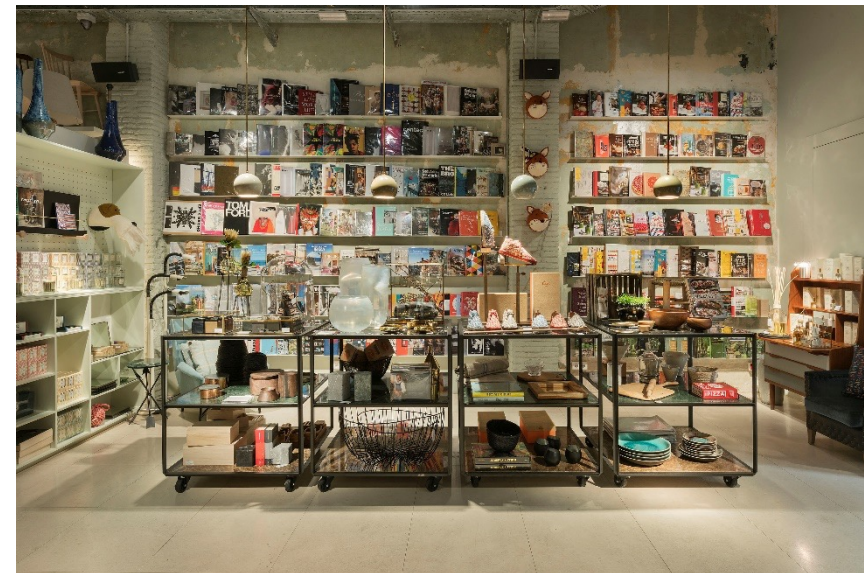
Jaime Beriestain Concept Store and Café, Barcelona