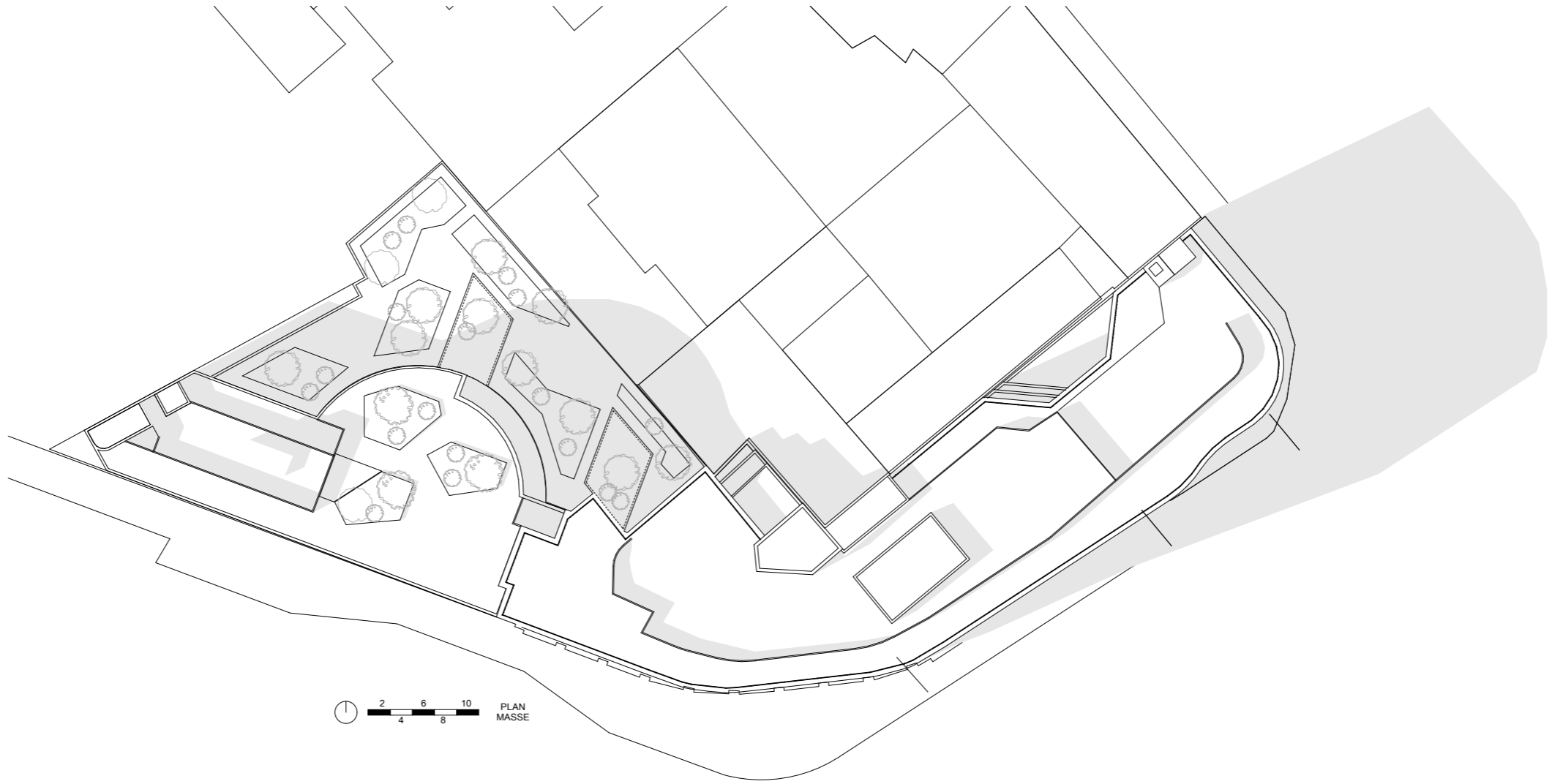
1 2 4 6 8 10 PLAN MASSE