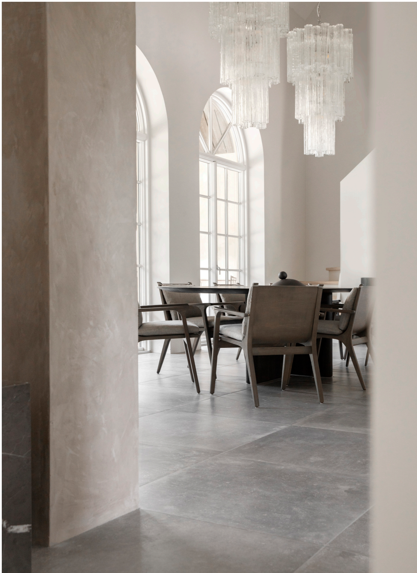
The sculptural dining table stands as a magnificent centerpiece in the bright and stone-floored dining room with textured walls and paned, floor-to-ceiling windows.