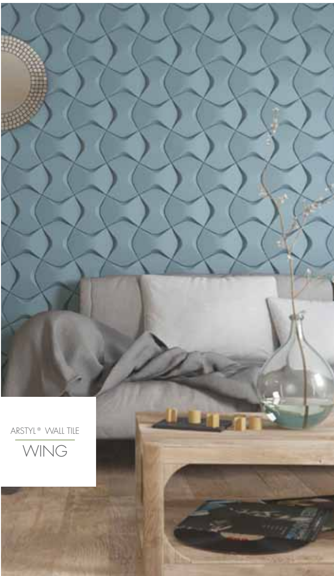
ARSTYL® WALL TILE WING