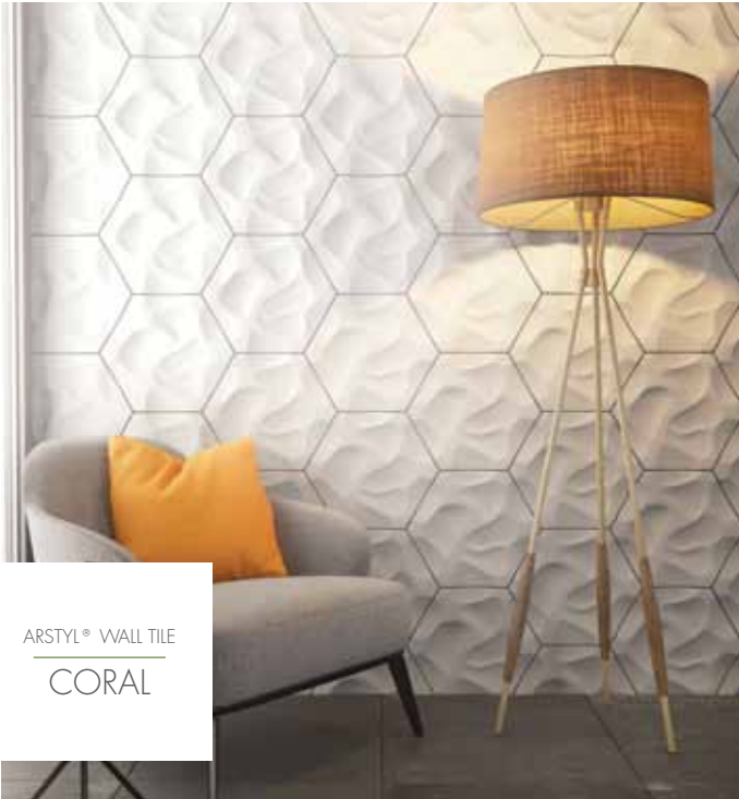
ARSTYL® WALL TILE CORAL