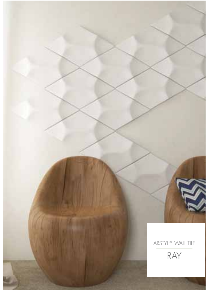
ARSTYL® WALL TILE RAY