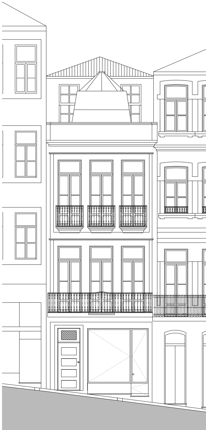
ALÇADO PRINCIPAL (A1)