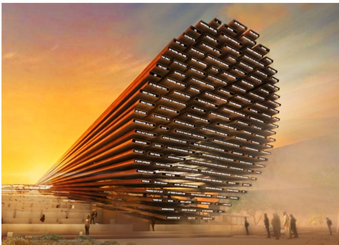
The Pavilion's 20-metre high glowing LED façade will beam out a collective A.I.- generated global message

The project will be titled The POEM PAVILION .