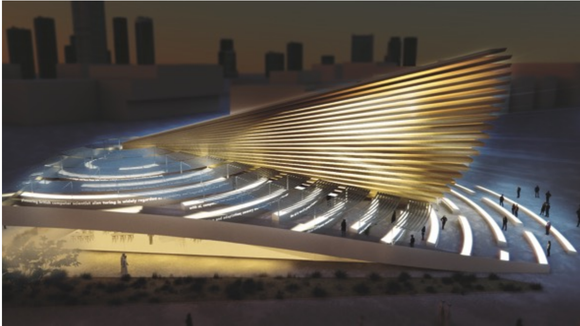
Visitors arrive through an illuminated maze featuring augmented reality enriched exhibits on British advances in Artificial Intelligence and Space