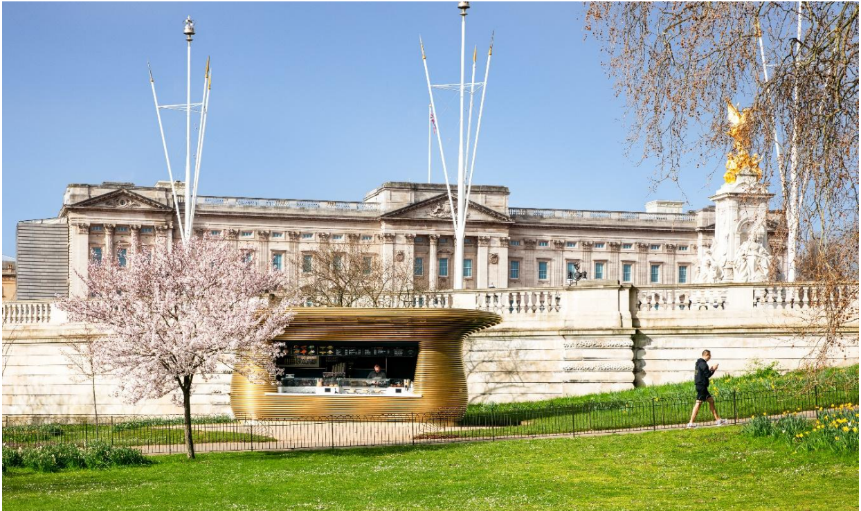
Brass Kiosk sitting underneath Buckingham Palace

As part of a significant public realm enhancement project across London's Royal Parks, architecture and design practice Mizzi Studio recently saw the installation of a brass tubular food kiosk at the foot of Buckingham Palace, representing the final leg in the project's completion. In summer 2017, on behalf of artisan brand Colicci, Mizzi Studio designed the landmark Serpentine Coffee House and a family of nine kiosks for prominent locations within The Royal Parks, London. The kiosks' installation roll-out began in October 2018, with the final kiosk erected on site at St James's Park last week.