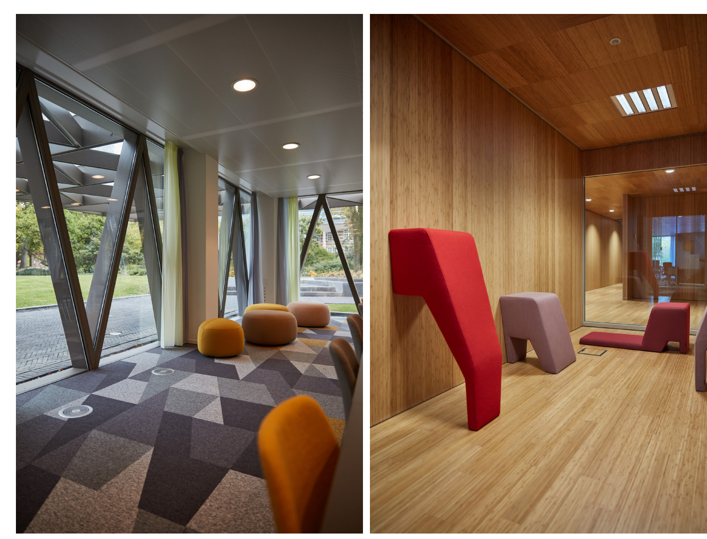
view of the park-like surroundings