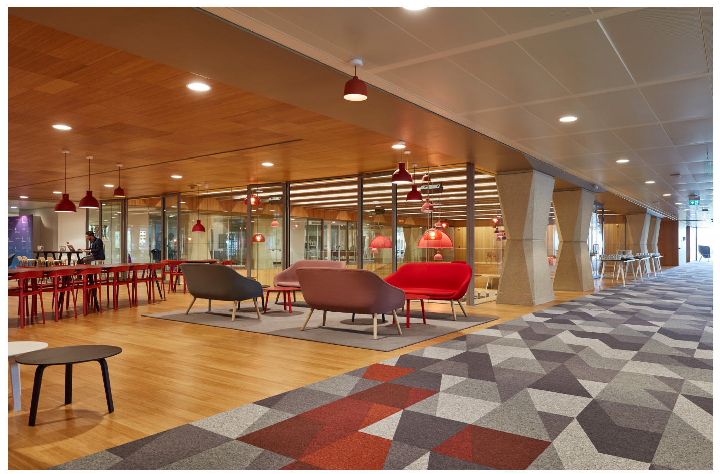
the Living Room