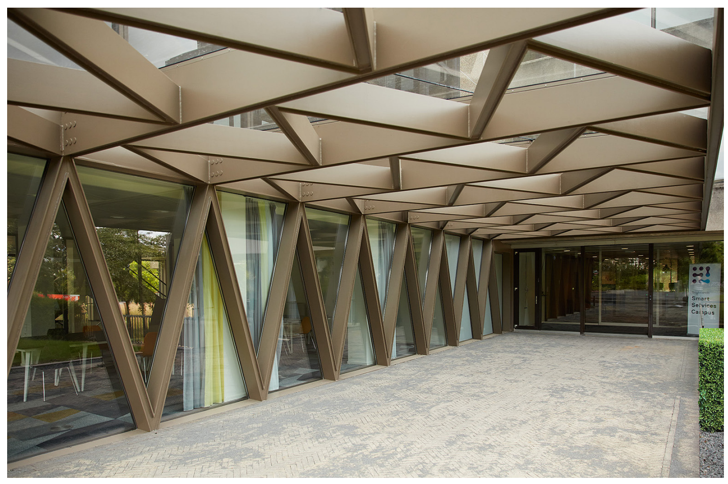
entrance with new awning