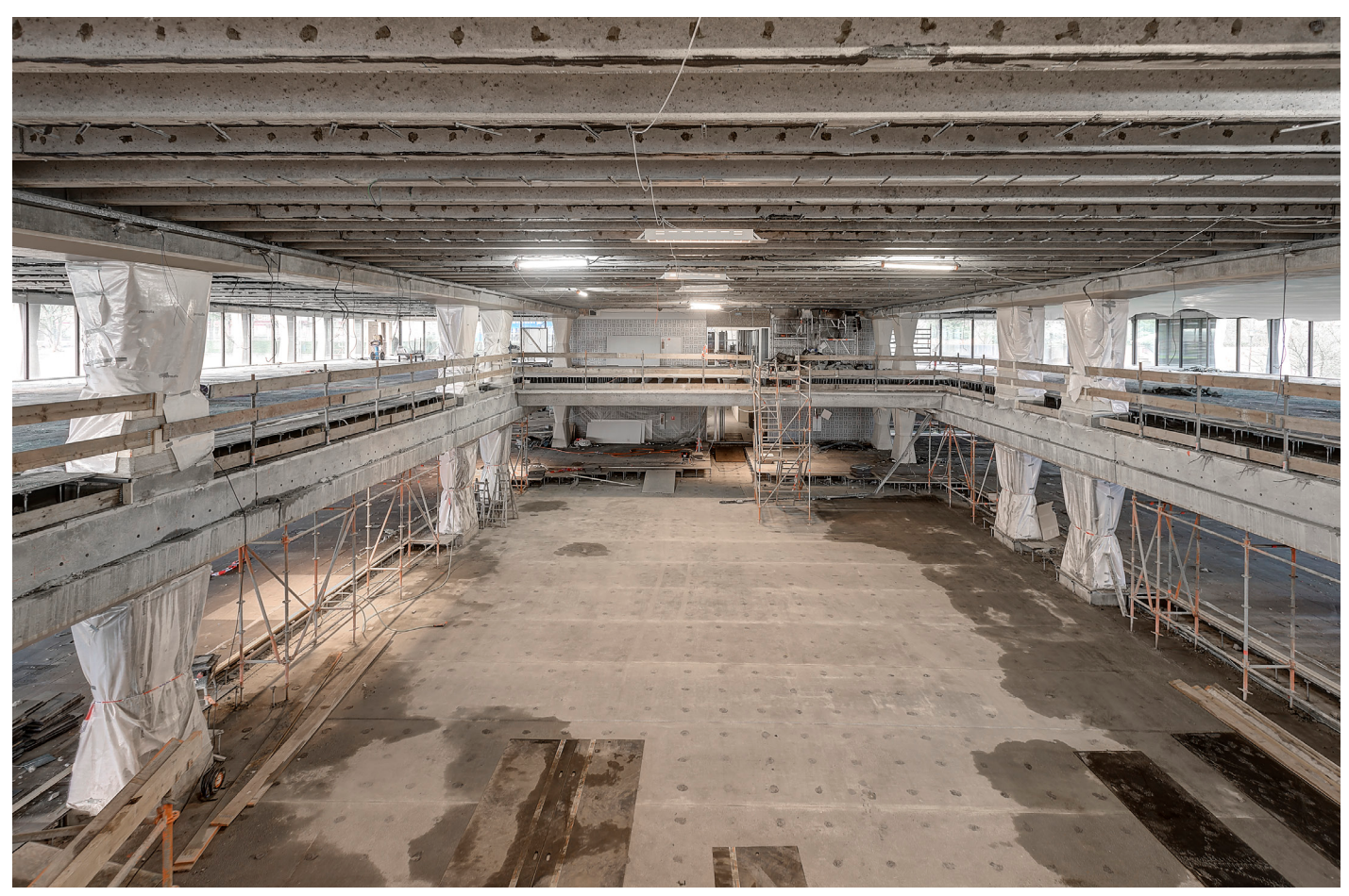
the Forum during transformation