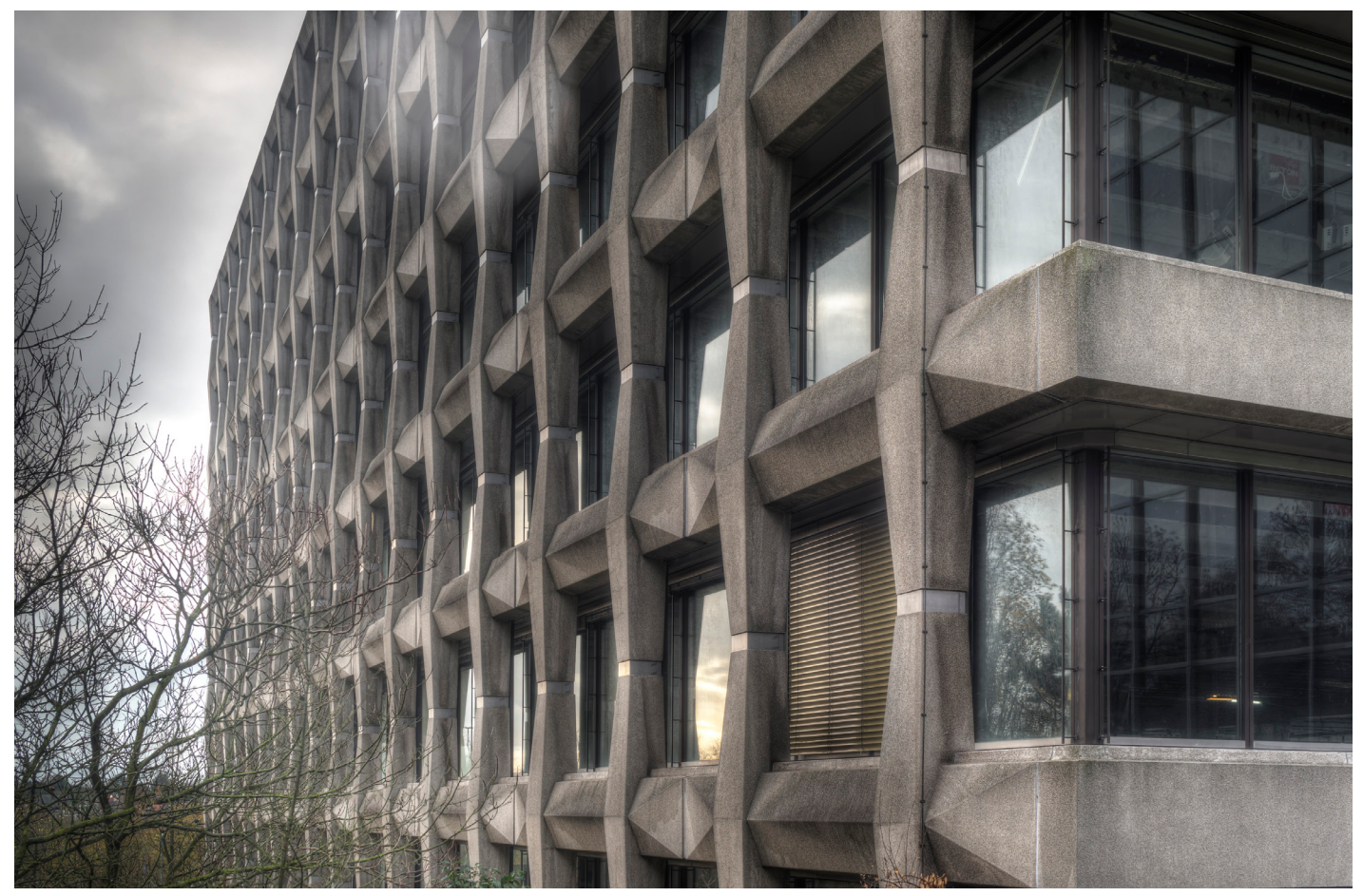
ABP office building for transformation