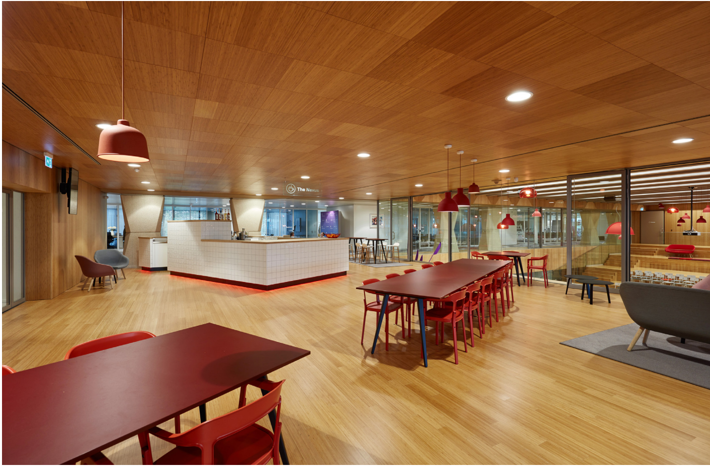
espresso bar in Living Room