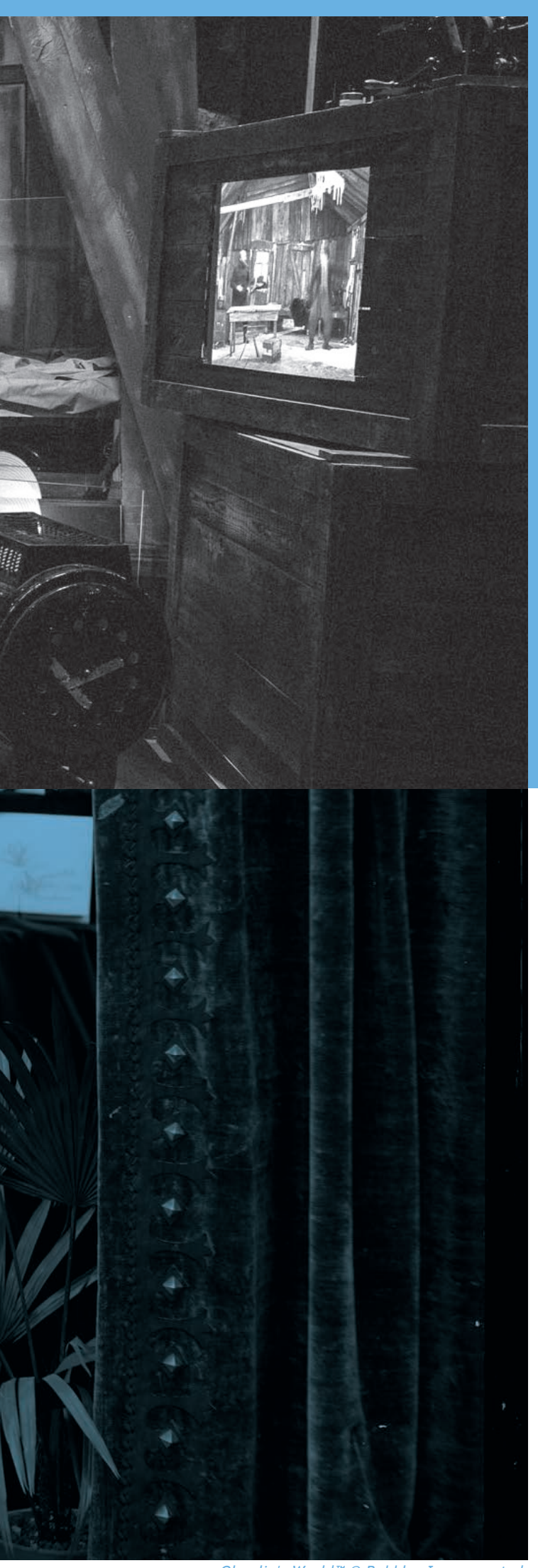
Chaplin's World™ © Bubbles Incorporated.