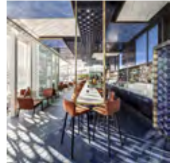
Address: Moll d'Escar 1, Barcelona Floor Area: 198m 2 Client: Salamanca Group