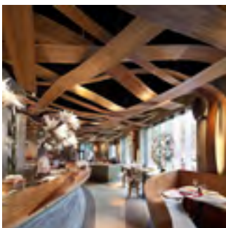
Address: Av. Paral·lelo 148, Barcelona Floor Area: 250m 2 Client: Ikibana