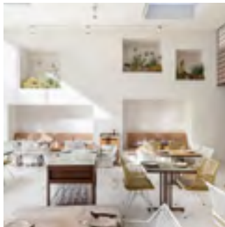
Address: Calle Villarreal 163, Barcelona Floor Area: 520m 2 Client: Eduard Xatruch, Oriol Castro, Mateu Casañas