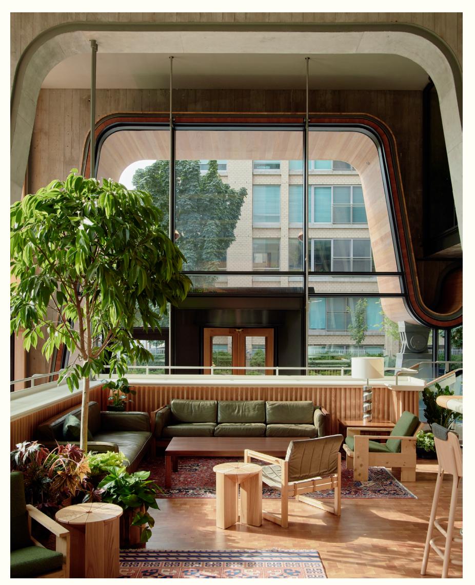
Ace Hotel Toronto Lobby