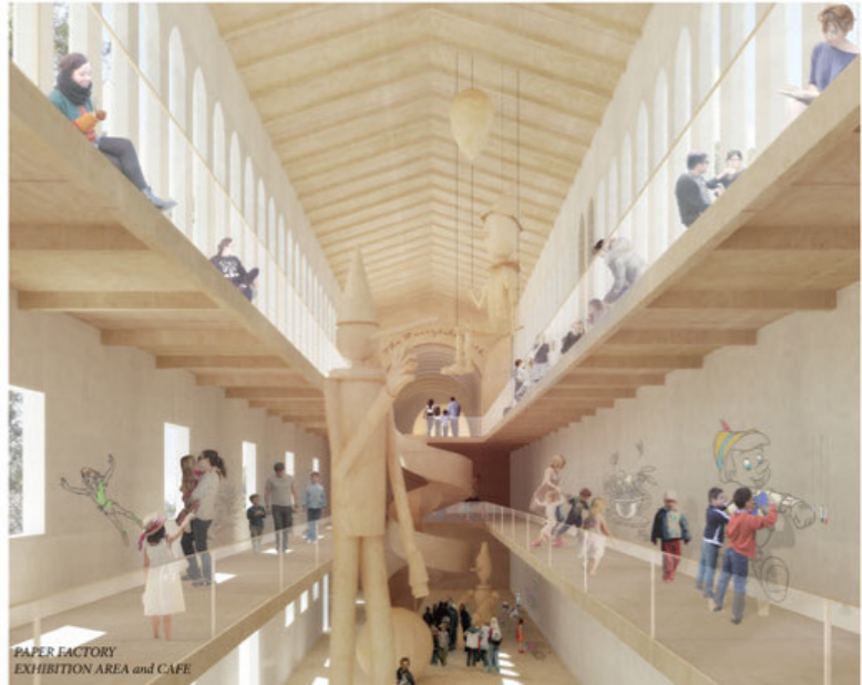
PAPER FACTORY EXHIBITION AREA AND CAFE