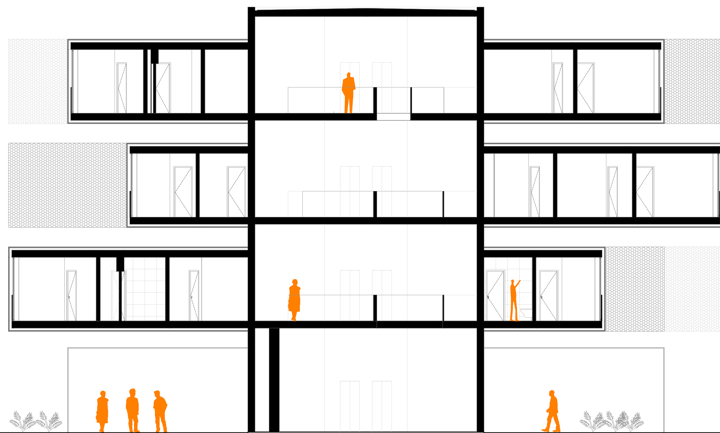
Corte AA' Escala 1:100