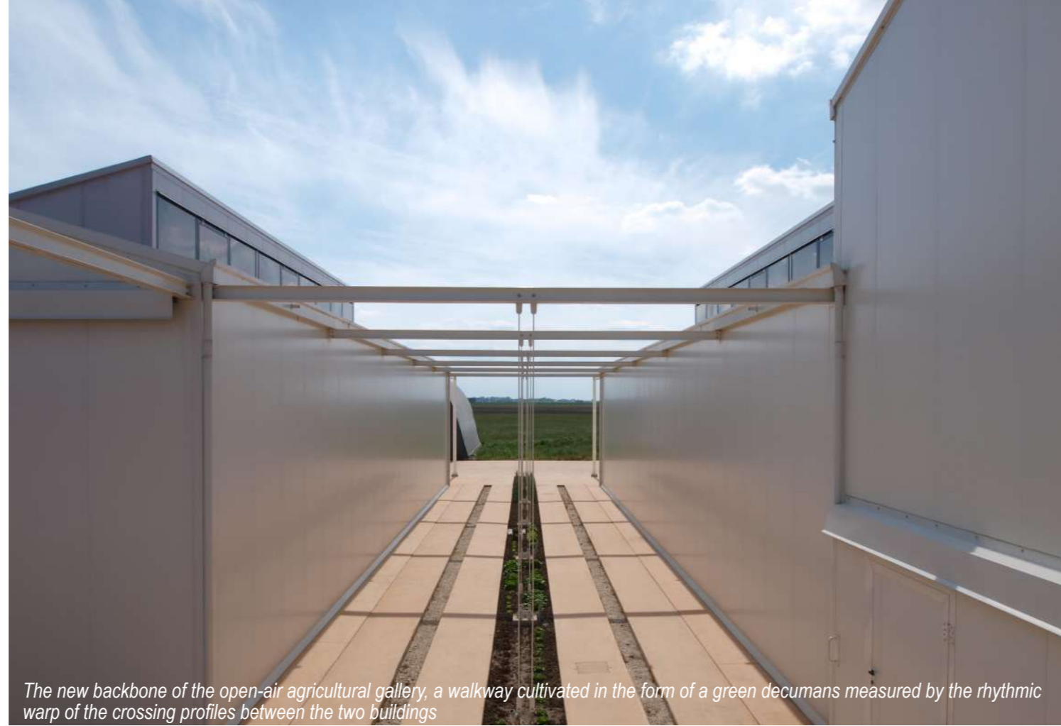
The new backbone of the open-air agricultural gallery, a walkway cultivated in the form of a green decumans measured by the rhythmic warp of the crossing profiles between the two buildings