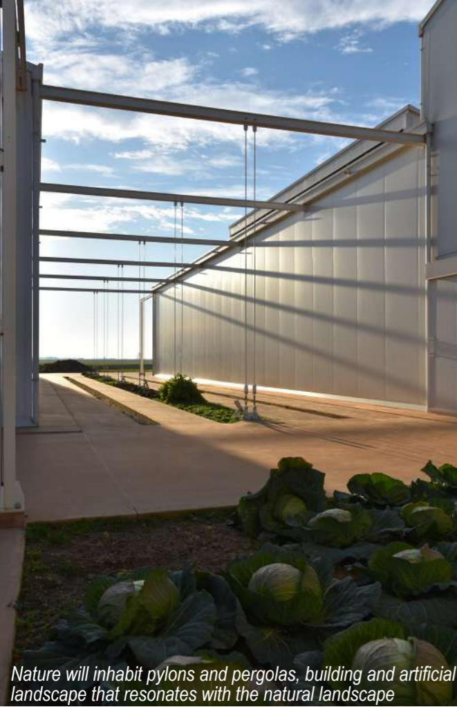
Nature will inhabit pylons and pergolas, building and artificial landscape that resonates with the natural landscape