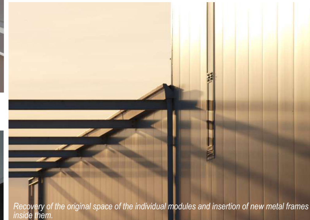
Recovery of the original space of the individual modules and insertion of new metal frames inside them.

The conception of space and serial production qualified as factors at the basis of technological progress and the democratic education of society. Industrial production as a vehicle for construction quality within everyone's reach.