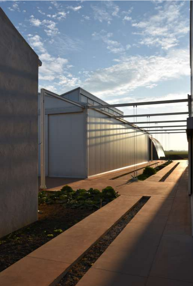
Median walk cultivated towards the countryside

The conception of space and serial production qualified as factors at the basis of technological progress and the democratic education of society. Industrial production as a vehicle for construction quality within everyone's reach.