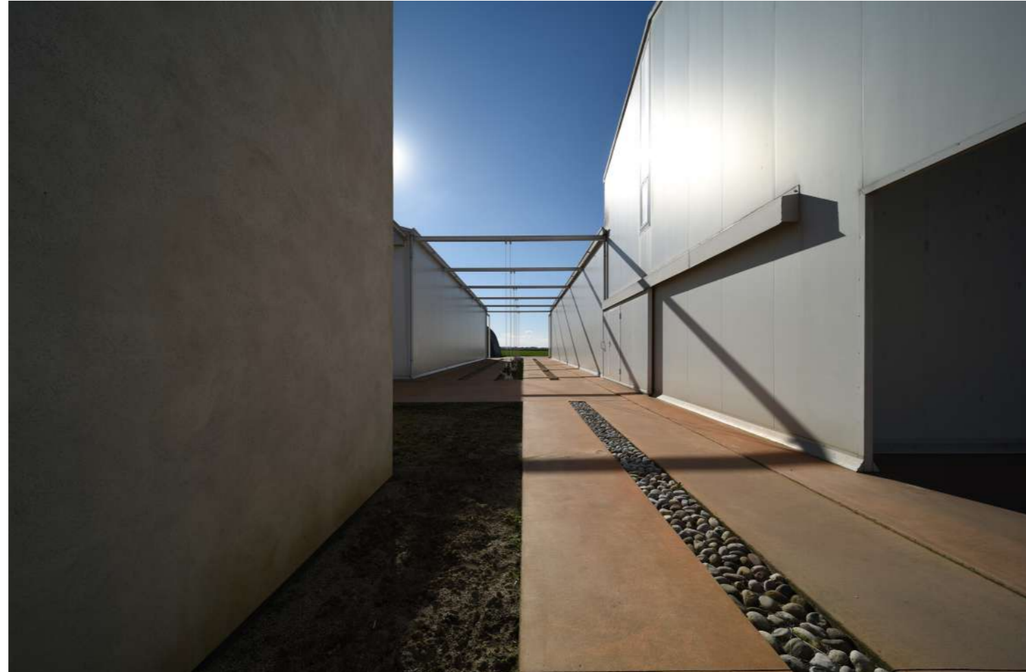
'Agricultural gallery' towards the rural horizon as the seasons and light conditions change.