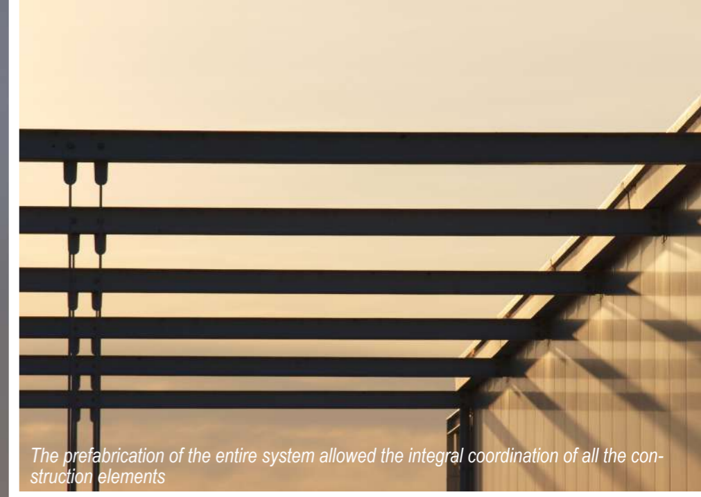
The prefabrication of the entire system allowed the integral coordination of all the construction elements