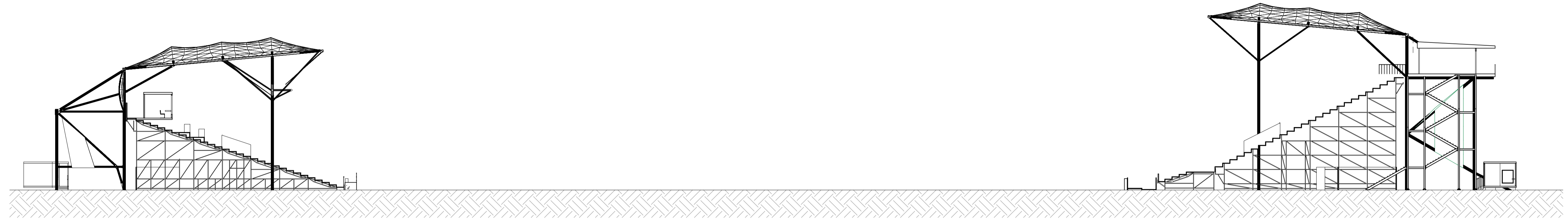
1 NORTH - SOUTH SECTION 1 : 250