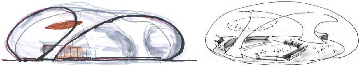
《sketches by Arata Isozaki》