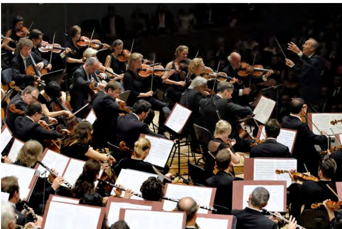
《LUCERNE FESTIVAL SUMMER 2012》

International architect Arata Isozaki is collaborating with India native and UK resident sculptor Anish Kapoor to develop a mobile concert hall with a capacity of 500 people. In this hall and the surrounding area, called ARK NOVA, various programs will be held during the period, blending performances of world artists, centered around LUCERNE FESTIVAL, and musical expression activities of the Tohoku region.