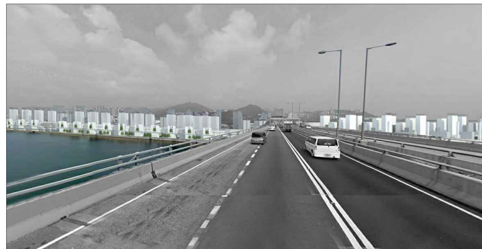
VIEW FROM THE VIADUCT