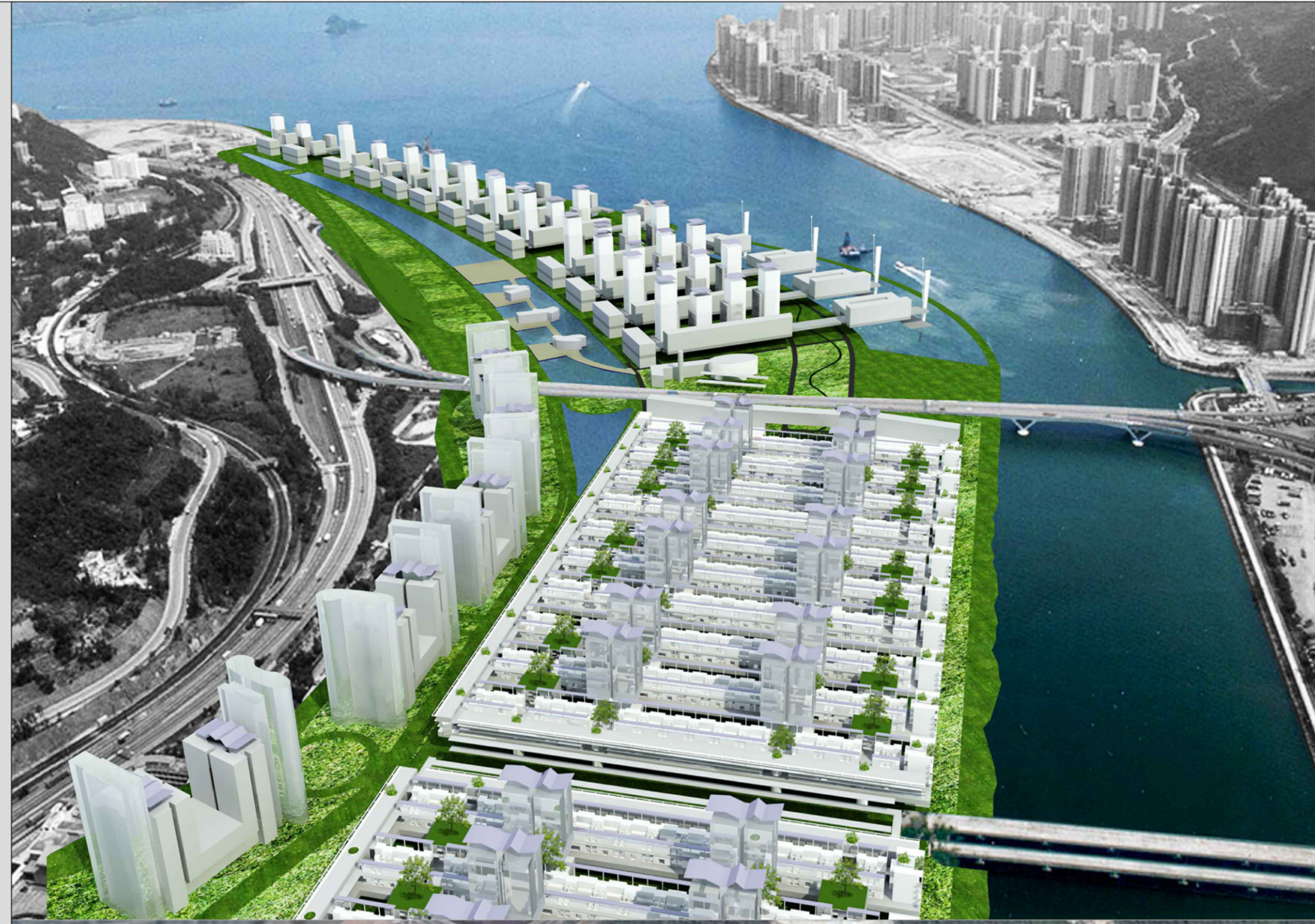
GRAZIN AERIAL VIEW FROM SHING MUN RIVER