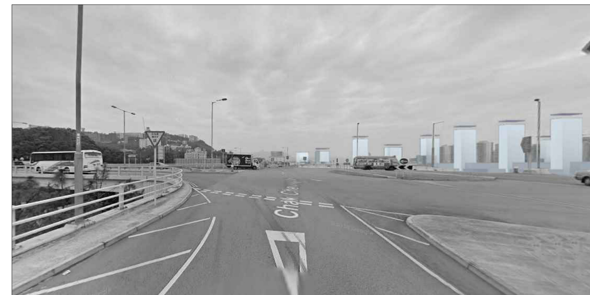
VIEW FROM THE OVERPASS