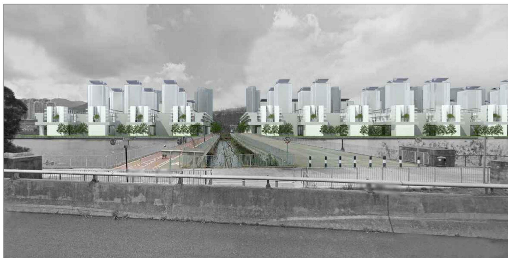
VIEW OF THE WATERFRONT