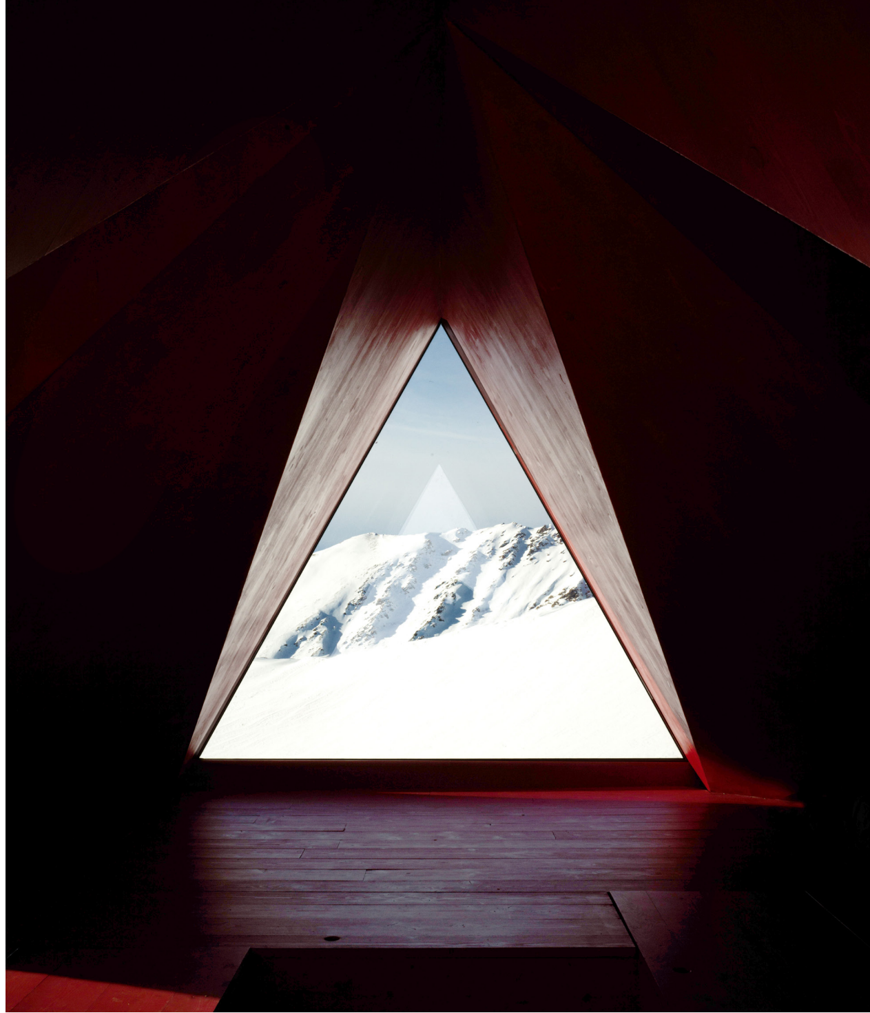
The reduced internal height and the sloping roof put the alpinists in a condition similar to the one we can experience inside a tent.