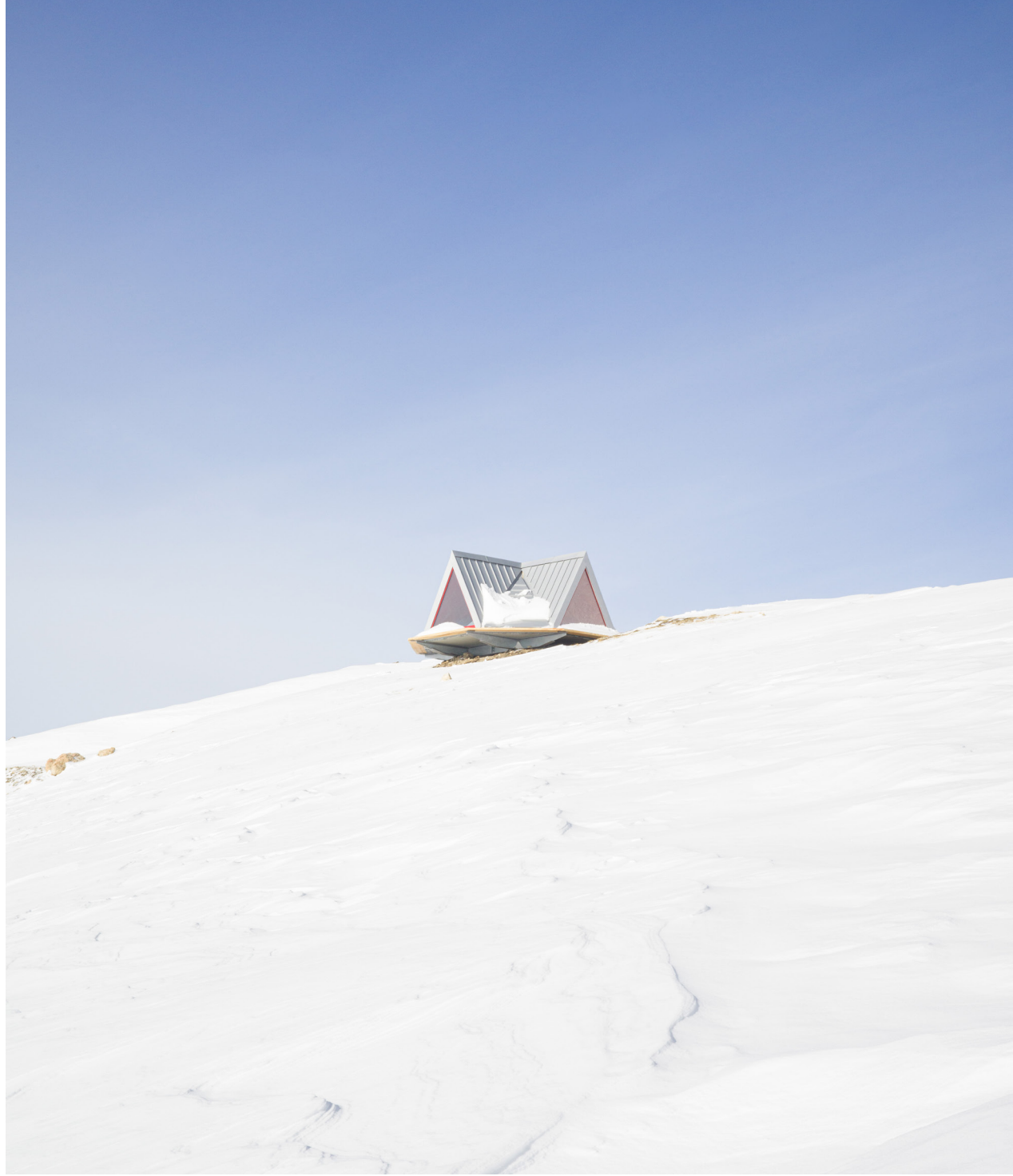
An atmospheric architecture, engaging in a dialogue with the light, colors of the rocks, and the surrounding slopes.