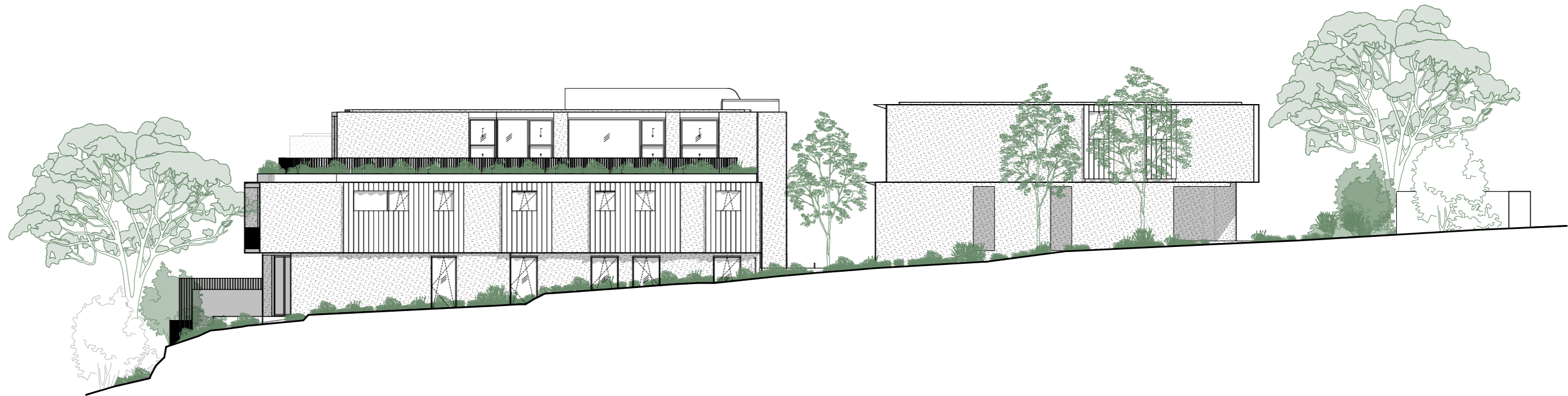
WEST ELEVATION 1:200