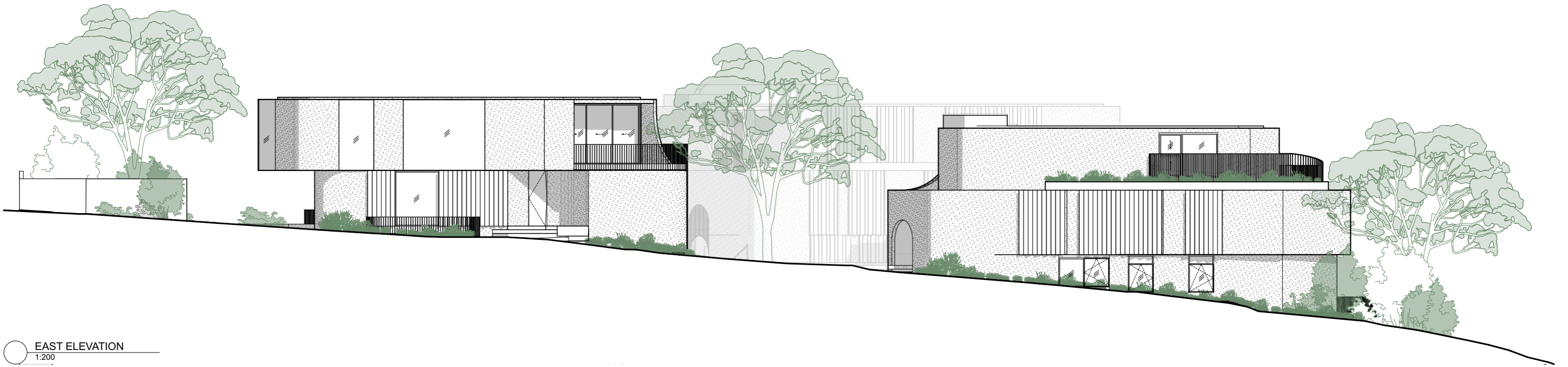
EAST ELEVATION 1:200