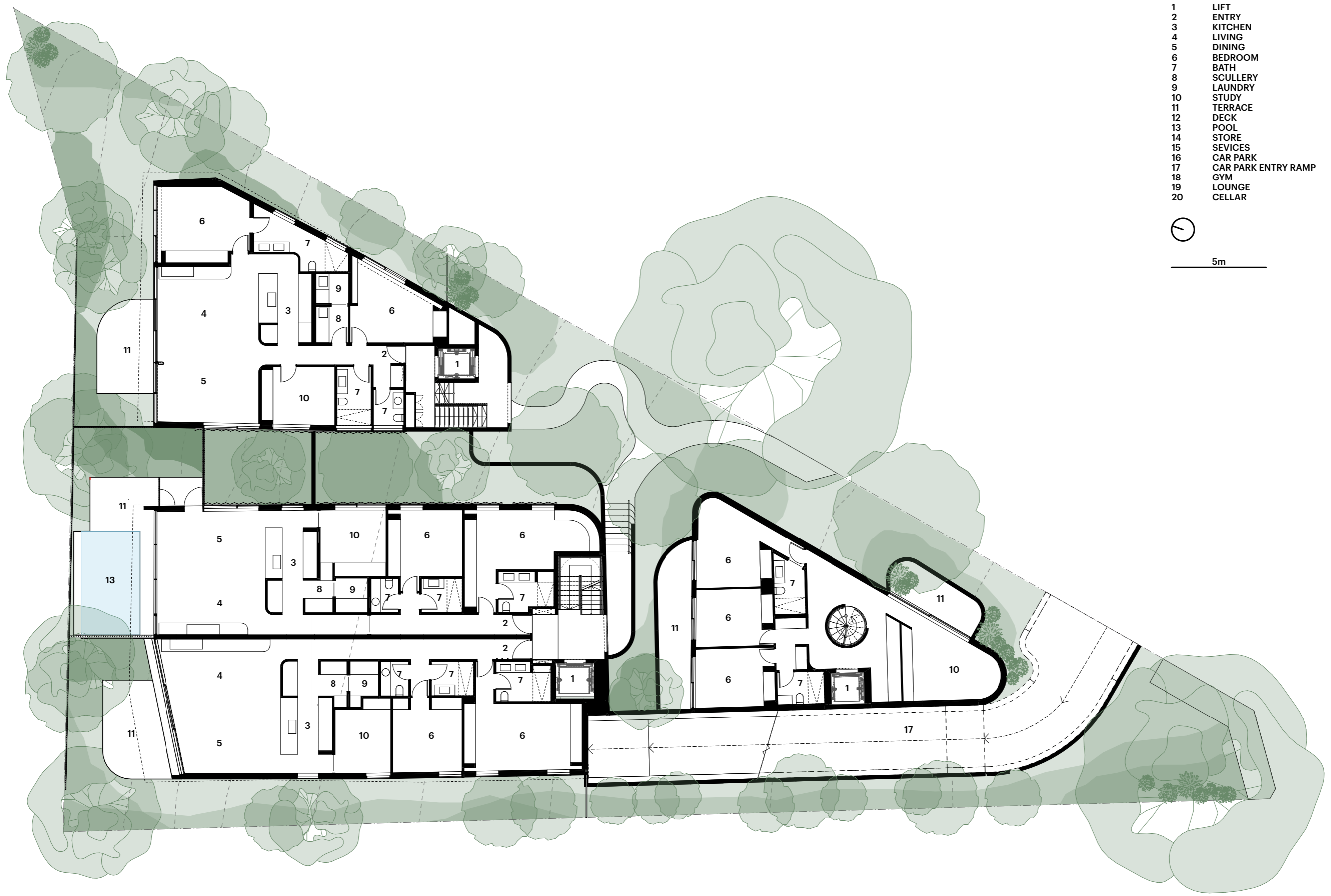
GROUND FLOOR 1:200